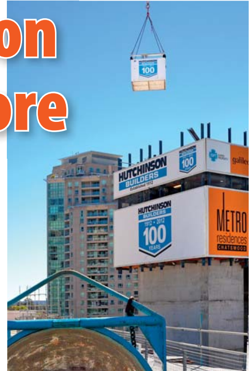
RIGHT: Hutchies on site at Chatswood in Sydney.