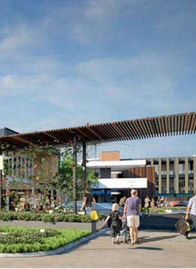
now underway on the Gold Coast.