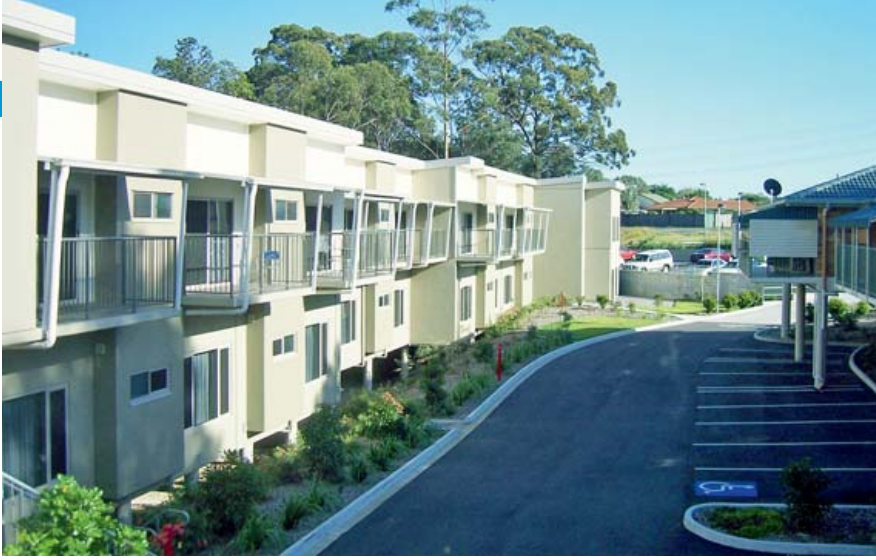
New facilities at Sunnymead Park Aged Care Community at Caboolture.