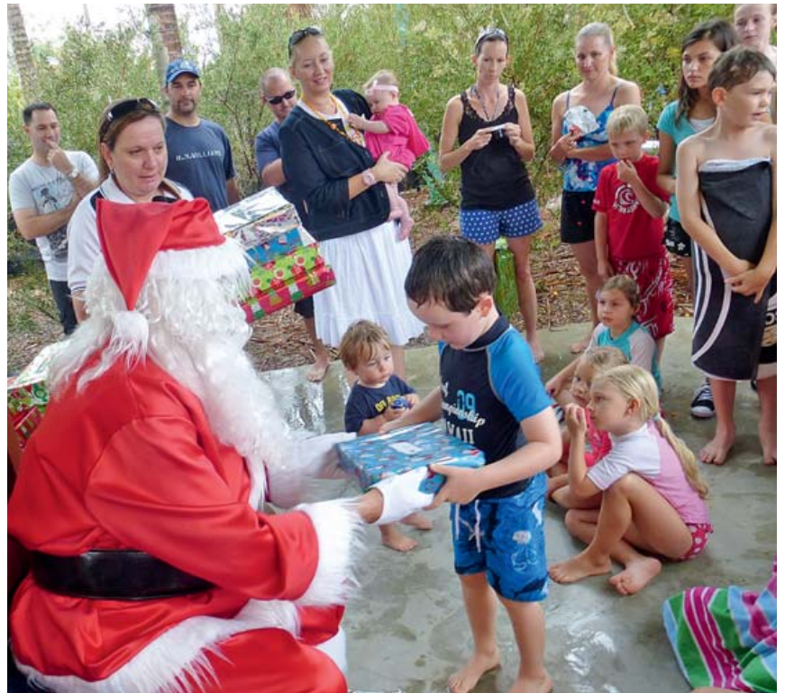
Christmas just around the corner When children queue up to meet Santa at Hutchies' Social Club Kids' Christmas Party, it's a sure sign the festive season is just around the corner. This year the kids met Santa at Dreamworld's White Water World on the Gold Coast where they gave Santa his shopping list before having a great time in the water. Hutchies' kids are pictured with Santa receiving early Christmas gifts.