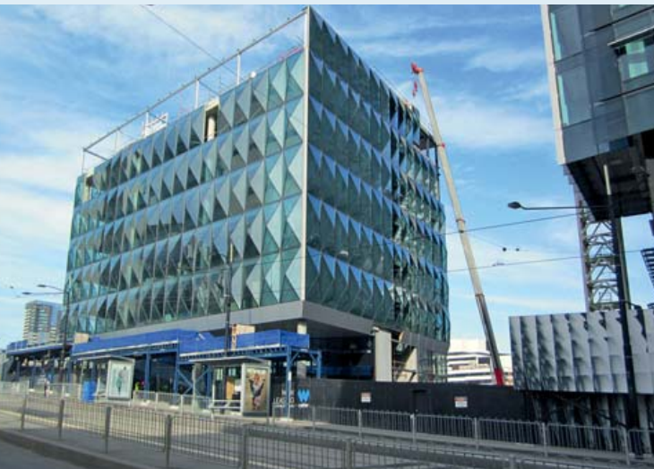
The Lantern Building in Collins Street, Melbourne is under construction.