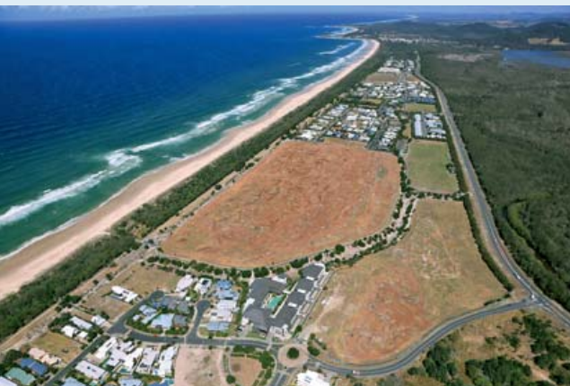
Aerial photograph of the site being prepared for the proposed Casuarina Town Centre.