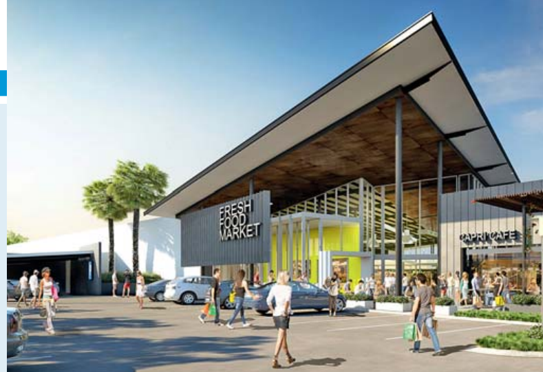
Stage two of the redevelopment of the Isle of Capri's commercial centre is