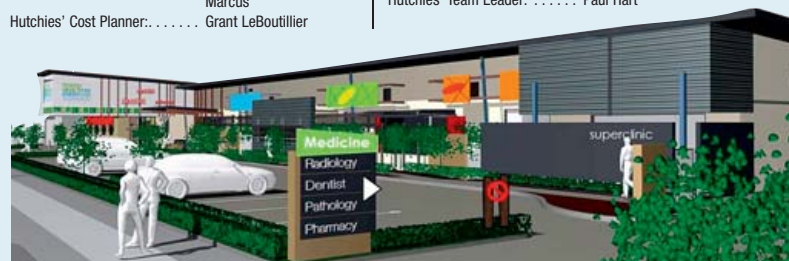
Artist's impression of the new federally funded 'super clinic' under construction in Tweed Heads.