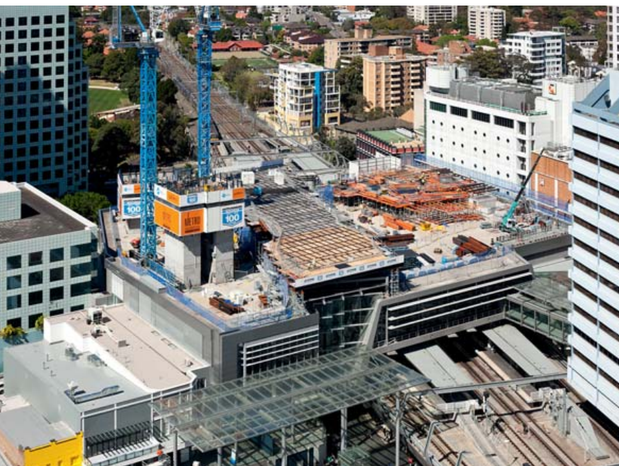
Three towers are emerging from above the Chatswood Transport Interchange and one is tipped to be the north shore's highest.